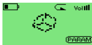
Figure 10.4.: Cube

This is a rotating cube screen saver in 3D.