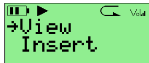
Figure 4.5.: The Playlist Submenu

The PLAYLIST SUBMENU is a submenu in the CONTEXT MENU (see section 4.1.2 (page 19)), it allows you to put tracks into a “dynamic playlist”. If there is no music currently playing, Rockbox will create a new dynamic playlist and put the selected track(s) into it. If there is music currently playing, Rockbox will put the selected track(s) into the current playlist. The place in which the newly selected tracks are added to the playlist is determined by the following options: