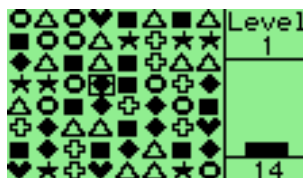
Figure 10.10.: Jewels

Jewels is a simple yet addicting game which involves swapping pairs of jewels in order to form connected segments of three or more of the same type.