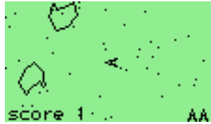
Figure 10.24.: Spacerocks

Spacerocks is a clone of the old arcade game Asteroids. The goal of the game is to blow up the asteroids and avoid being hit by them. Once in a while, a UFO will appear – shoot this for extra points.