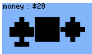
Figure 10.9.: Jackpot

This is a jackpot slot machine game. At the beginning of the game you have 20$. Payouts are given when three matching symbols come up.