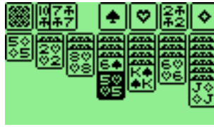
Figure 10.23.: Klondike solitaire

This is the classic Klondike solitaire game for Rockbox. This is probably the best-known solitaire in the world. Many people do not even realize that other games exist. Though the name may not be familiar, the game itself certainly is. This is due in no small part to Microsoft's inclusion of the the game in every version of Windows. Though popular, the odds of winning are rather low, perhaps one in thirty hands.