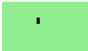
Figure 10.20.: Snake