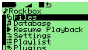
Figure 5.1.: The main menu

The MAIN MENU is the screen from which all of the Rockbox functions can be accessed. This is the first screen you will see when starting Rockbox. To return to the MAIN MENU, hold the Mode button.