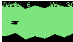
Figure 10.6.: Chopper

Navigate a cavernous maze without banging into walls, the ceiling, or the floor. How long can you fly your chopper?