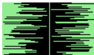
Figure 10.35.: Oscilloscope

This demo shows the shape of the sound samples that make up the music being played.