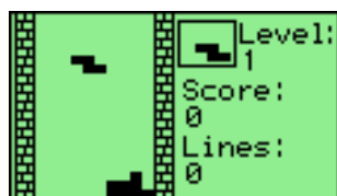
Figure 10.16.: Rockblox

Rockblox is a Rockbox version of the classic falling blocks game from Russia. The aim of the game is to make the falling blocks of different shapes form full rows. Whenever