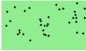
Figure 10.38.: Have you ever seen snow falling?

This demo replicates snow falling on your screen. If you love winter, you will love this demo. Or maybe not. Press On/Off or Long On/Off to quit.