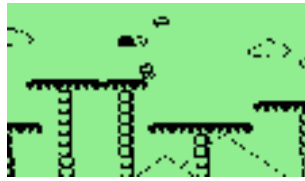
Figure 12.41.: Rockboy

Rockboy is a Nintendo Game Boy and Game Boy Color emulator for Rockbox based on the gnuboy emulator. To start a game, open a ROM file saved as .gb or .gbc in the file browser.