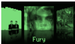
Figure 12.36.: PictureFlow

PictureFlow provides a visualisation of your albums with their associated cover art.