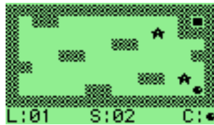
Figure 12.25.: Star game

This is a puzzle game. It is actually a rewrite of Star, a game written by CDK designed for the hp48 calculator.