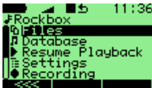
Figure 5.1.: The main menu

The MAIN MENU is the screen from which all of the Rockbox functions can be accessed. This is the first screen you will see when starting Rockbox. To return to the MAIN MENU, press the F1 button.