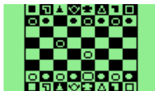
Figure 12.5.: Chessbox

Chessbox is a one-person chess game with computer artificial intelligence. The chess engine is a port of GNU Chess 2 by John Stanback.