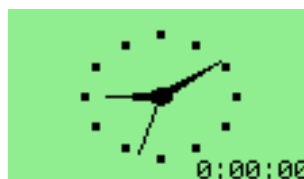
Figure 12.49.: Clock

This is a fully featured analogue and digital clock plugin.