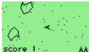
Figure 12.24.: Spacerocks

Spacerocks is a clone of the old arcade game Asteroids. The goal of the game is to blow up the asteroids and avoid being hit by them. Once in a while, a UFO will appear – shoot this for extra points.