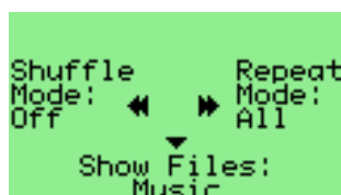
Figure 4.5.: The F2 quick screen