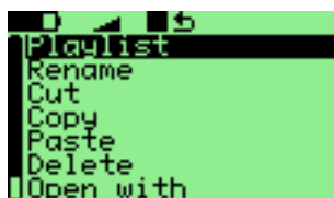
Figure 4.2.: The Context Menu

The CONTEXT MENU allows you to perform certain operations on files or directories. To access the CONTEXT MENU, position the selector over a file or directory and access the context menu with Long Play .