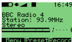
Figure 5.4.: The FM radio screen

This menu option switches to the radio screen. The FM radio has the ability to remember station frequency settings (presets). Since stations and their frequencies vary depending on location, it is possible to load these settings from a file. Such files should have the filename extension .fmr and reside in the directory /.rockbox/fmpresets (note that this directory does not exist after the initial Rockbox installation; you should create it manually). To load the settings, i.e. a set of FM stations, from a preset file, just