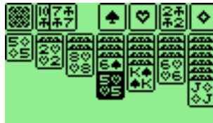
Figure 12.23.: Klondike solitaire