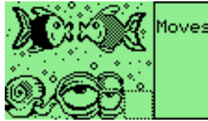
Figure 12.19.: Sliding puzzle

The classic sliding puzzle game. Rearrange the pieces so that you can see the whole picture, or switch to number tiles if you like it a little easier. Includes one picture puzzle. You can also use the sliding puzzle plugin as a viewer for supported image types, to turn your own pictures into a puzzle.