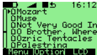
Figure 4.1.: The file browser

Rockbox lets you browse your music in either of two ways. The FILE BROWSER lets you navigate through the files and directories on your player, entering directories and executing the default action on each file. To help differentiate files, each file format is displayed with an icon.