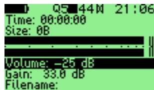
Figure 5.3.: The while recording screen

Selecting the RECORDING option in the MAIN MENU enters the RECORDING SCREEN, whilst pressing Long Play enters the RECORDING SETTINGS (see section 10 (page 70)). The RECORDING SCREEN shows the time elapsed and the size of the file being recorded. A peak meter is present to allow you set gain correctly. There is also a volume setting, this will only affect the output level of the player and does not affect the recorded sound. If enabled in the peak meter settings, a counter in front of the peak meters shows the number of times the clip indicator was activated during recording. The counter is reset to zero when starting a new recording.