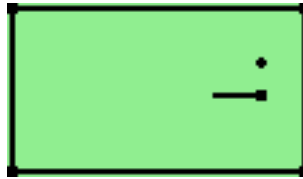
Figure 12.21.: Snake 2 – The Snake Strikes Back

Another version of the Snake game. Move the snake around, and eat the apples that pop up on the screen. Each time an apple is eaten, the snake gets longer. The game ends when the snake hits a wall, or runs into itself.