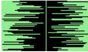
Figure 12.35.: Oscilloscope

This demo shows the shape of the sound samples that make up the music being played.