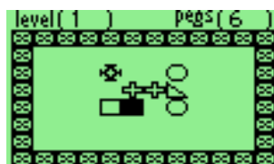
Figure 12.13.: pegbox

To beat each level, you must destroy all of the pegs. If two like pegs are pushed into each other they disappear except for triangles which form a solid block and crosses which allow you to choose a replacement block.